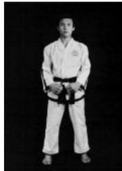
Parallel ready stance toward D.