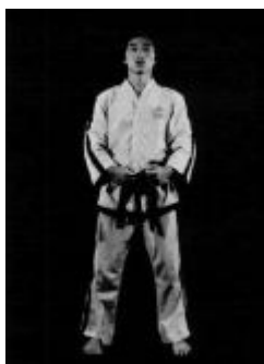
Parallel ready stance toward D.