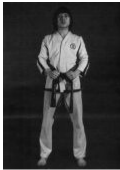
Parallel ready stance toward D.